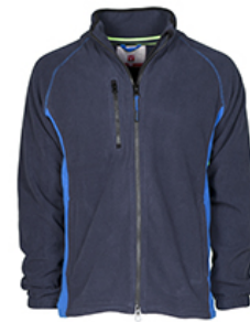
NAVY BLUE/ROYAL BLUE