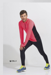
BERLIN MEN 01416