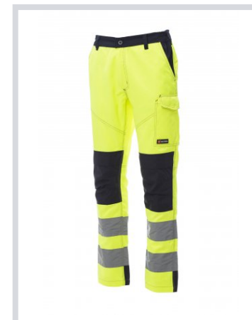
FLUORESCENT YELLOW/NAVY BLUE