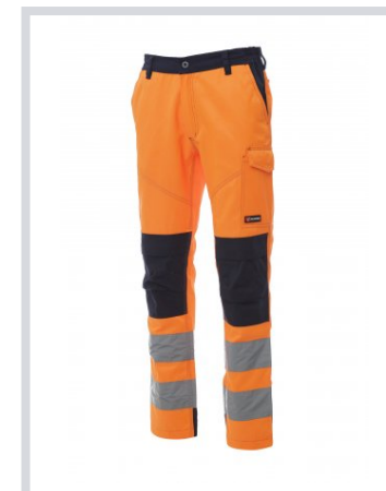
FLUORESCENT ORANGE/NAVY BLUE