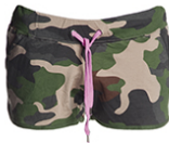
CAMOUFLAGE/FLUORES CENT FUCHSIA