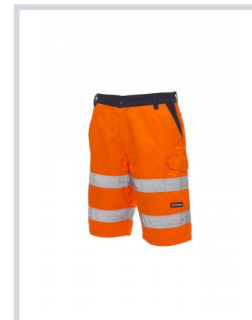
FLUORESCENT ORANGE/NAVY BLUE