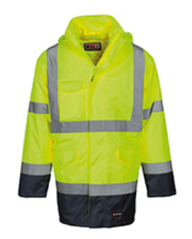
FLUORESCENT YELLOW/NAVY BLUE