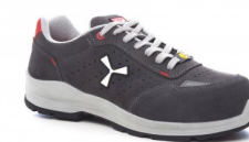
S1005 STEEL GREY