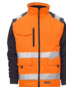
FLUORESCENT ORANGE/NAVY BLUE