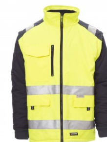
FLUORESCENT YELLOW/NAVY BLUE