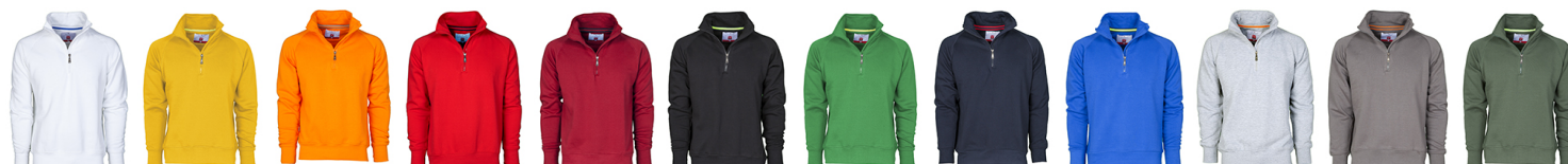
WHITE YELLOW ORANGE RED BORDEAUX BLACK JELLY GREEN NAVY BLUE ROYAL BLUE MELANGE GREY SMOKE GREEN