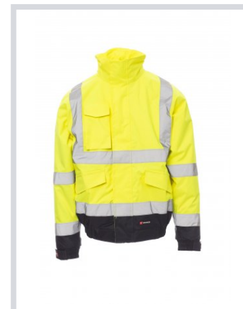
FLUORESCENT YELLOW/NAVY BLUE