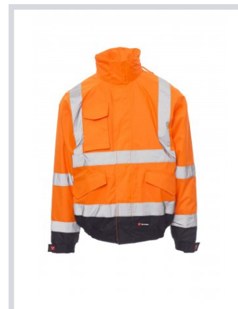
FLUORESCENT ORANGE/NAVY BLUE