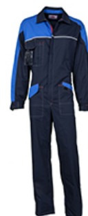
NAVY BLUE/ROYAL BLUE