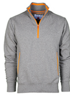
ASH GREY MELANGE/ORANGE