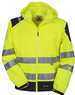
FLUORESCENT YELLOW/NAVY BLUE