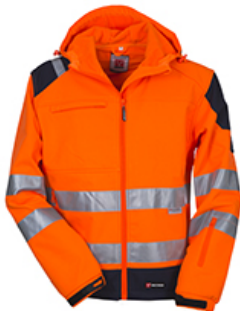
FLUORESCENT ORANGE/NAVY BLUE