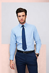
SOL'S BRIGHTON 17000