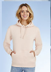
SOL'S SPENCER WOMEN 03103