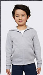
SOL'S STONE KIDS 02092