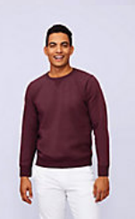
SOL'S SULLY 02990