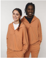
Stella Cropster Wave Terry Globetrotter Wave Terry

Shell : Seersucker Terry , 100% Cotton - Organic Ring Spun Combed , Panel washed , 350 GSM