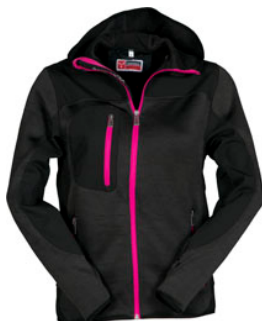
MELANGE STEEL GREY/BLACK-FLUORESCENT FUCHSIA