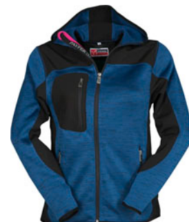
MELANGE BLUE/BLACK-FLUORESCENT FUXIA