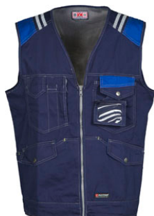
NAVY BLUE/ROYAL BLUE