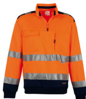
FLUORESCENT ORANGE/NAVY BLUE