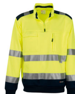
FLUORESCENT YELLOW/NAVY BLUE